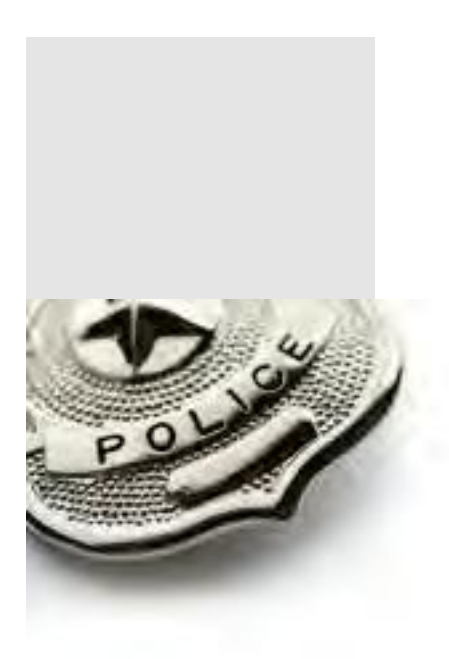
Seven police officers arrested in 2021; 36 had certification issues